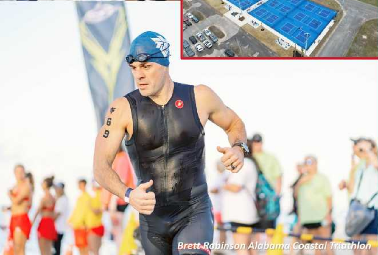
Brett Robinson Alabama Coastal Triathlon