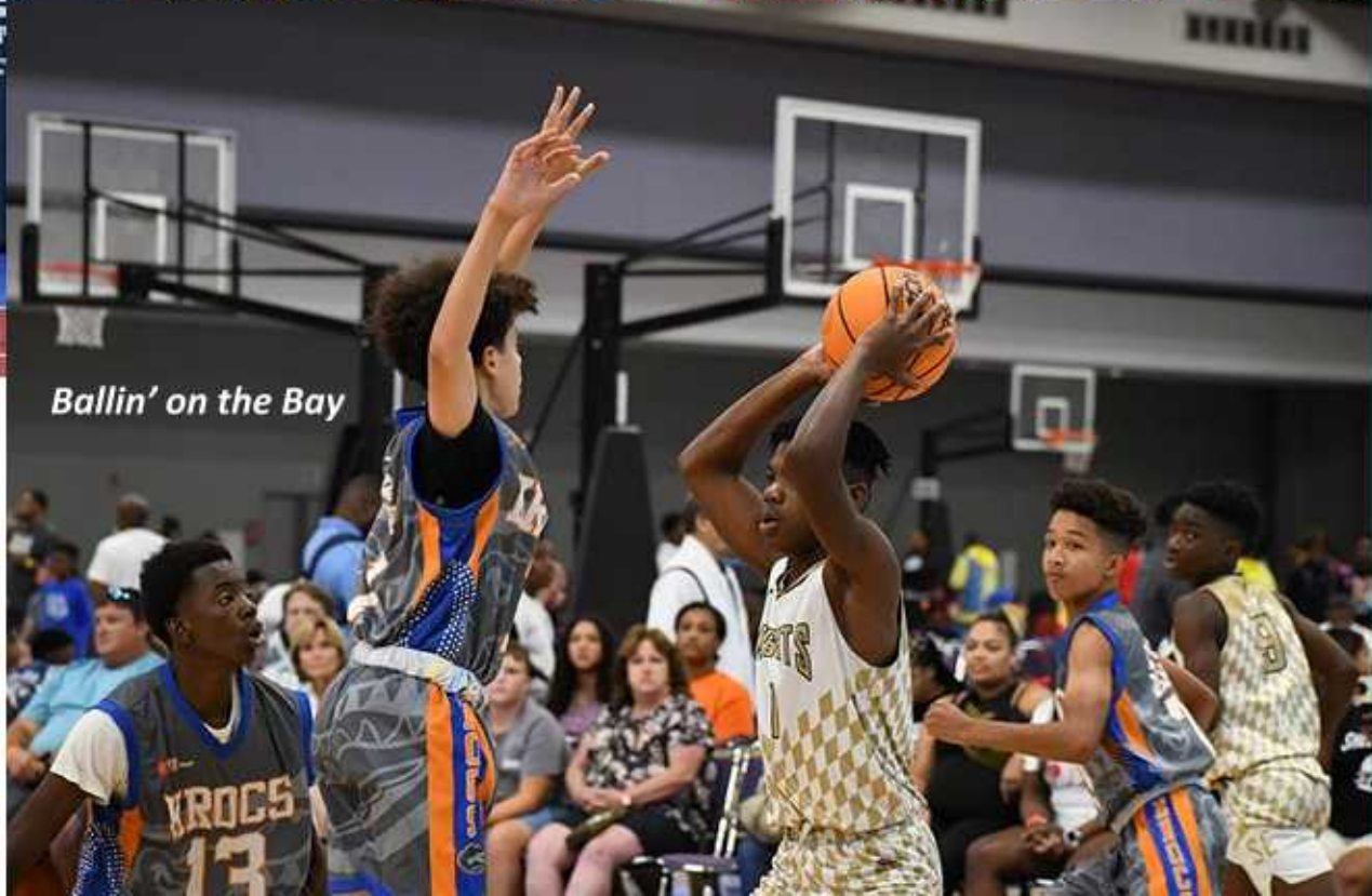
Ballin' on the Bay