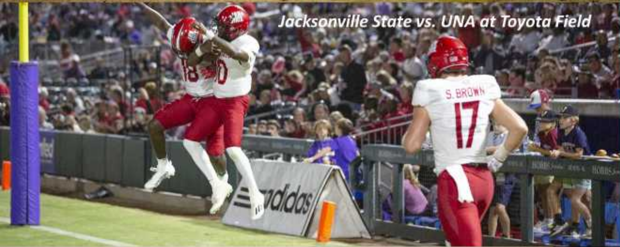
Jacksonville State vs. UNA at Toyota Field