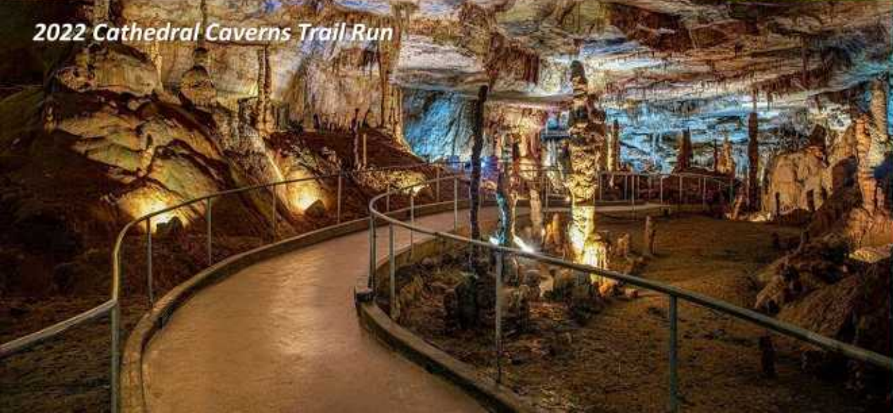
2022 Cathedral Caverns Trail Run