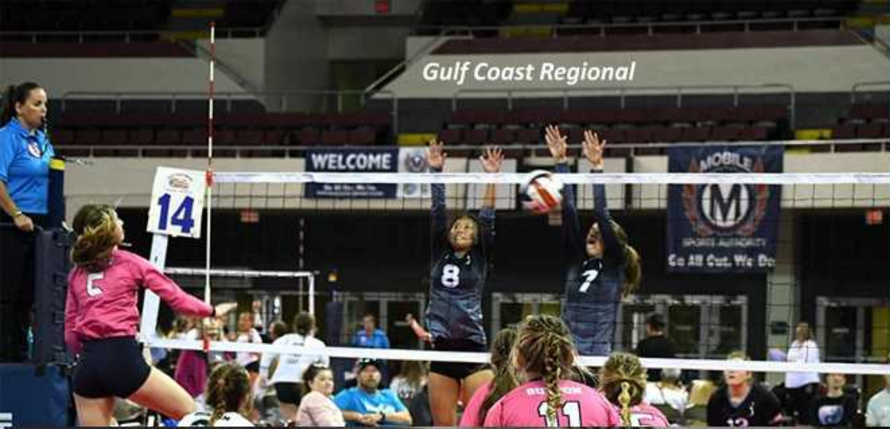
Gulf Coast Regional