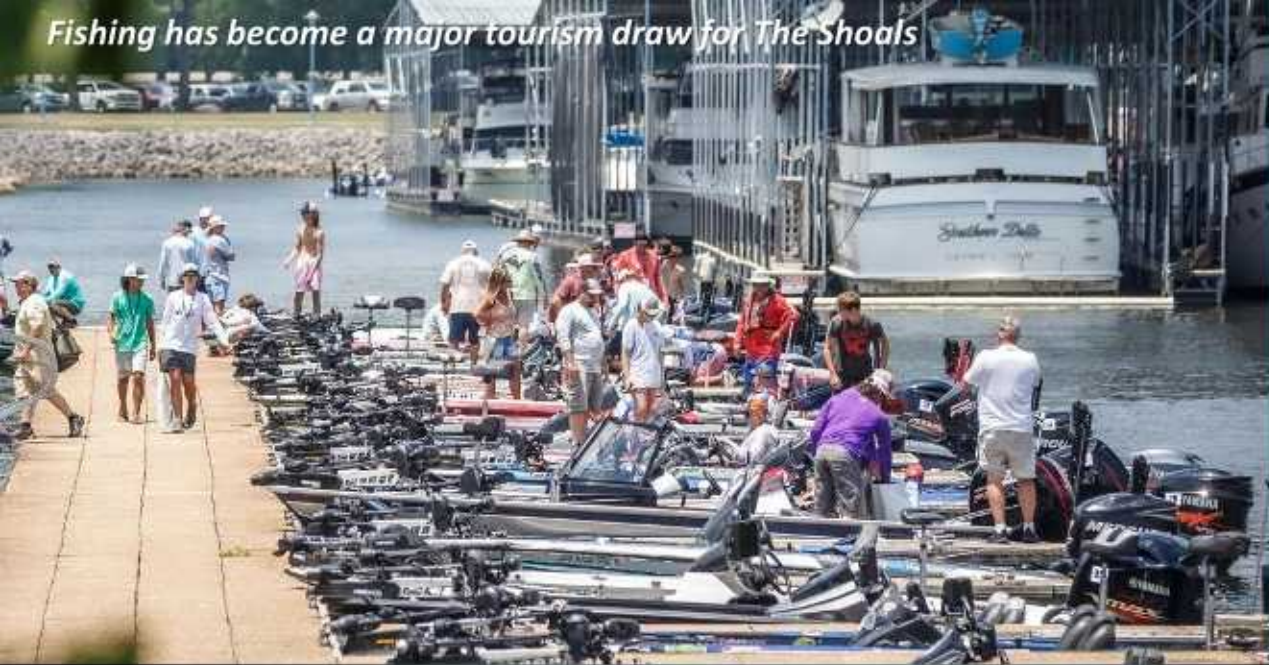
Collegiate National Championship

Fishing has become a major tourism draw for The Shoals