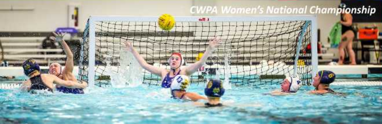
CWPA Women's National Championship