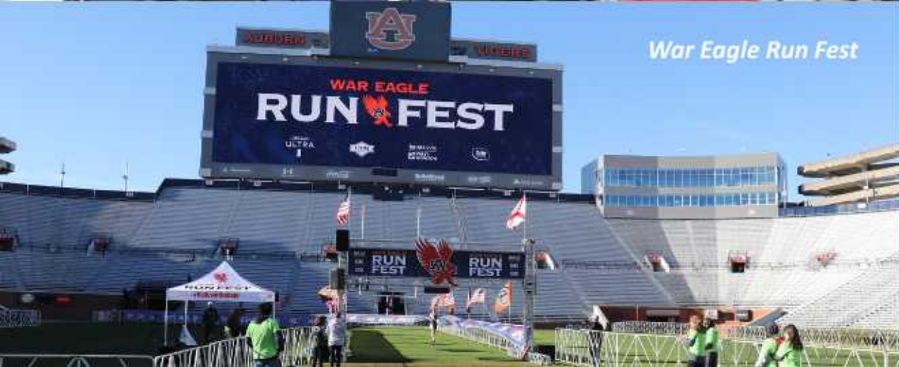
War Eagle Run Fest