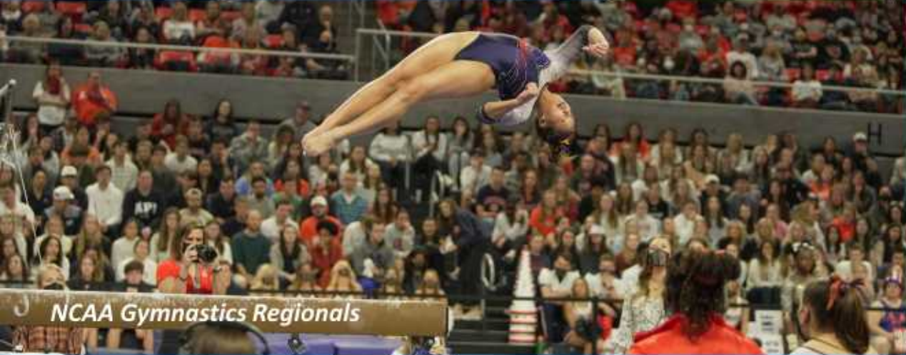
NCAA Gymnastics Regionals