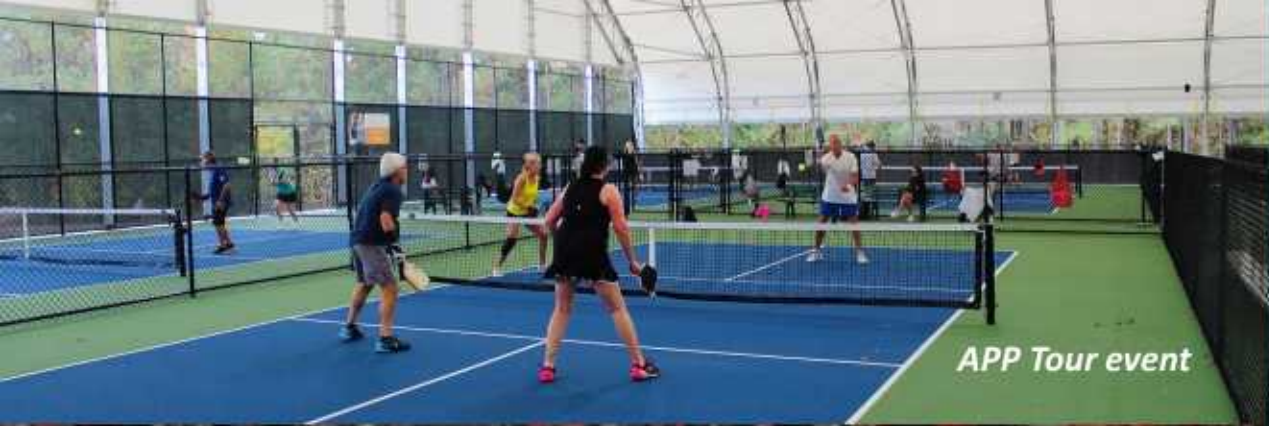
APP Tour event