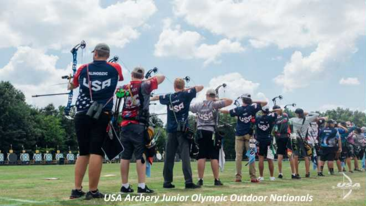
USA Archery Junior Olympic Outdoor Nationals